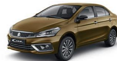
DIGNITY BROWN PEARL METALLIC