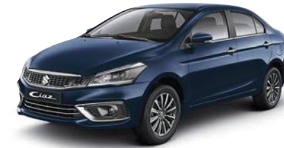
CELESTIAL BLUE PEARL METALLIC