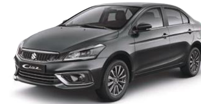
GRANDEUR GRAY PEARL METALLIC