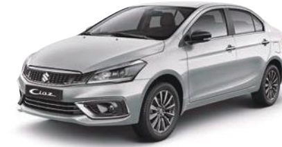
SPLENDID SILVER PEARL METALLIC