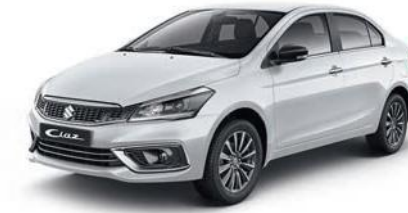
ARCTIC WHITE PEARL