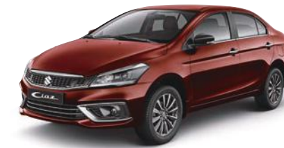
OPULENT RED PEARL METALLIC