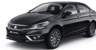
MIDNIGHT BLACK PEARL