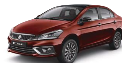
OPULENT RED PEARL METALLIC + MIDNIGHT BLACK