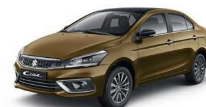
DIGNITY BROWN PEARL METALLIC + MIDNIGHT BLACK