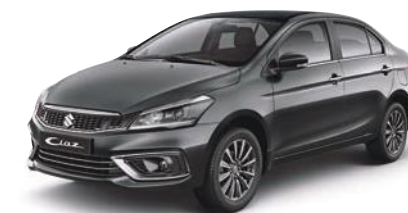
GRANDEUR GRAY PEARL METALLIC + MIDNIGHT BLACK