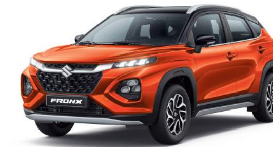
Lucent Orange Pearl Metallic x Bluish Black Pearl (E88)