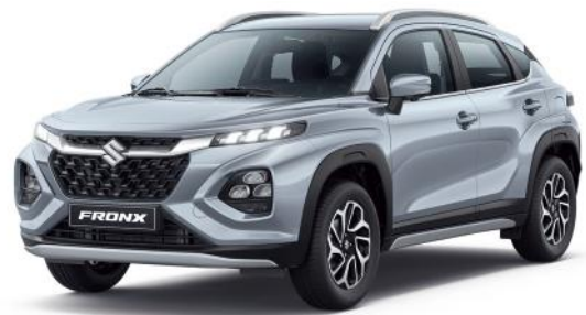
Splendid Silver Pearl Metallic (WBE)