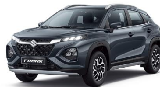
Grandeur Grey Pearl Metallic (WBF)