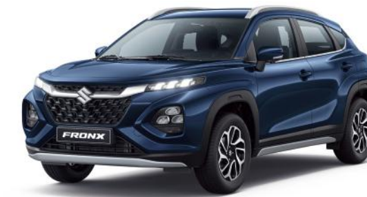
Celestial Blue Pearl Metallic (WBH)