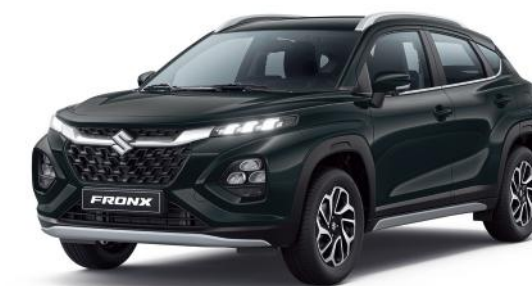
Bluish Black Pearl (WB3)