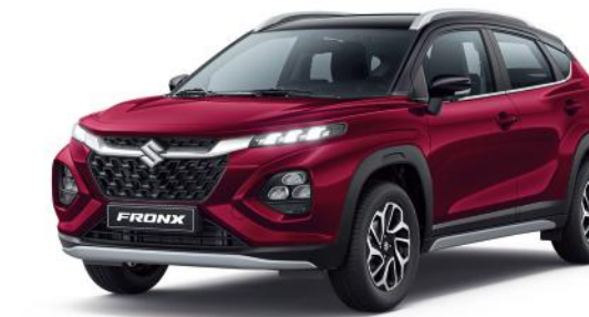
Opulent Red Pearl Metallic x Bluish Black Pearl (E86)