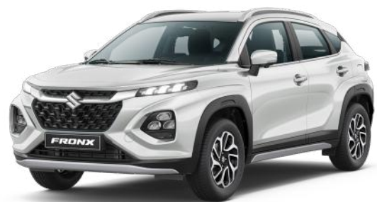
Arctic White Pearl (ZHJ)