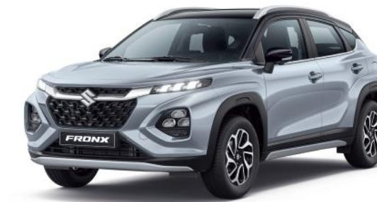
Splendid Silver Pearl Metallic x Bluish Black Pearl (E85)