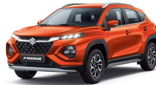
Lucent Orange Pearl Metallic (ZYE)